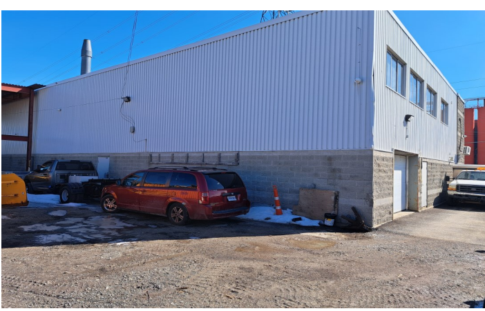
© Les Services Immobiliers Magna—R.D. Inc. 2024. All rights reserved. All information contained herein was obtained from sources deemed reliable, but for which we assume no liability or guarantee regarding the accuracy of said information.