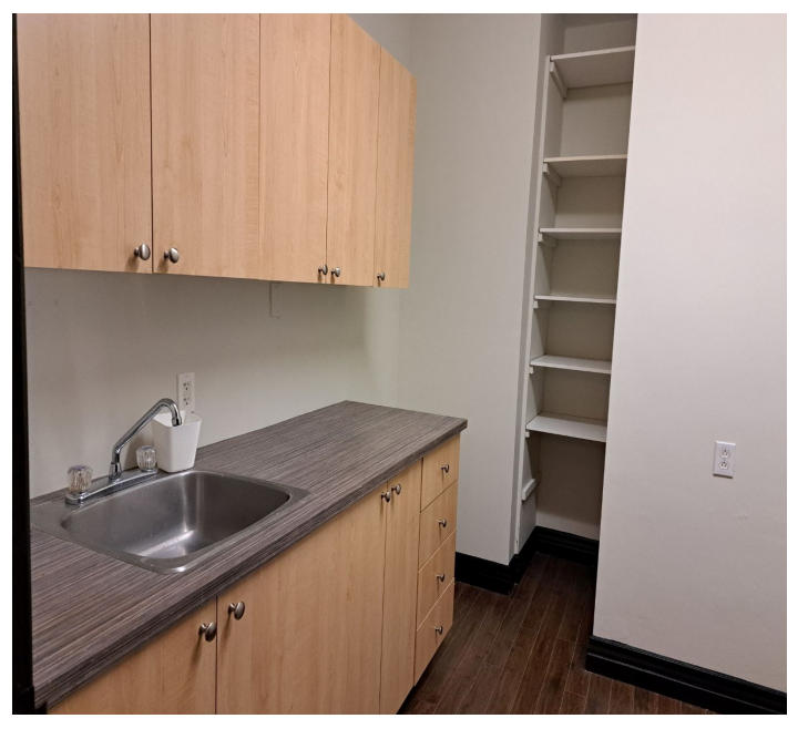
© Les Services Immobiliers Magna—R.D. Inc. 2024. All rights reserved. All information contained herein was obtained from sources deemed reliable, but for which we assume no liability or guarantee regarding the accuracy of said information.