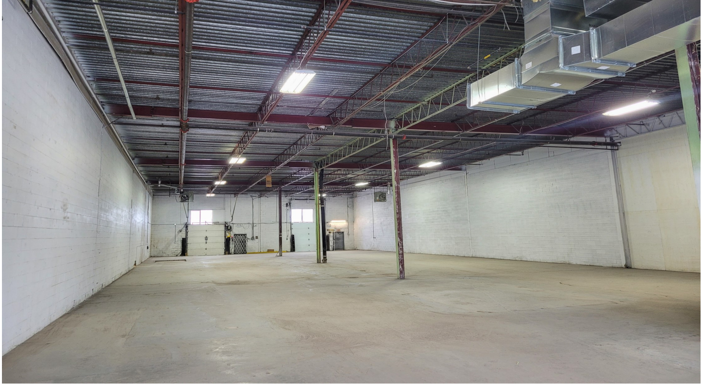
© Les Services Immobiliers Magna—R.D. Inc. 2024. All rights reserved. All information contained herein was obtained from sources deemed reliable, but for which we assume no liability or guarantee regarding the accuracy of said information.