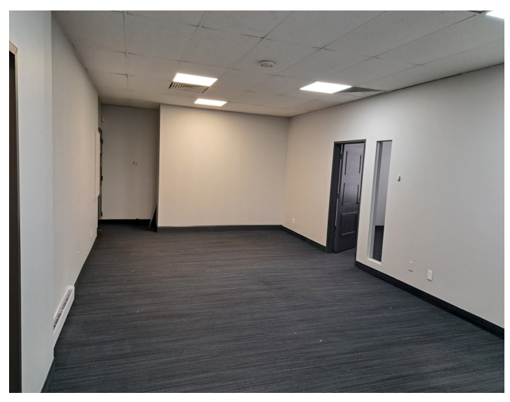
© Les Services Immobiliers Magna—R.D. Inc. 2023. All rights reserved. All information contained herein was obtained from sources deemed reliable, but for which we assume no liability or guarantee regarding the accuracy of said information.